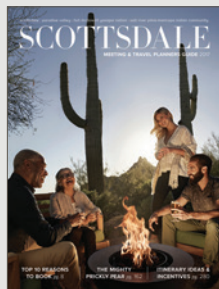
Meeting & Travel Planners Guide